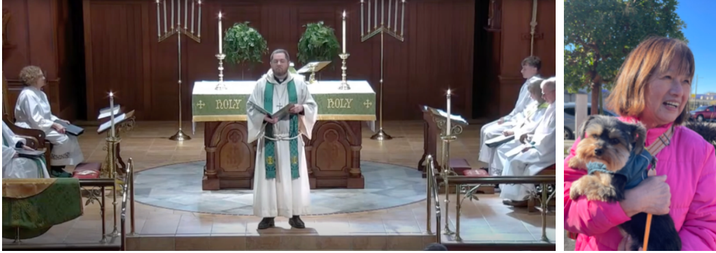
Christ Church observed the 140 th anniversary of the Eureka Chinatown Expulsion and donated $2K to the Eureka Chinatown Monument in February 2025.