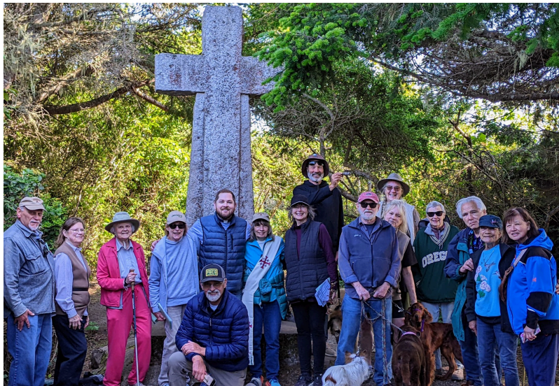
Sacred Saunter in Trinidad commemorated the 250th anniversary of the first Holy Trinity Eucharist in Trinidad in June 2025.

Click here for link to Mad River Union article about the Trinity Sacred Saunter.