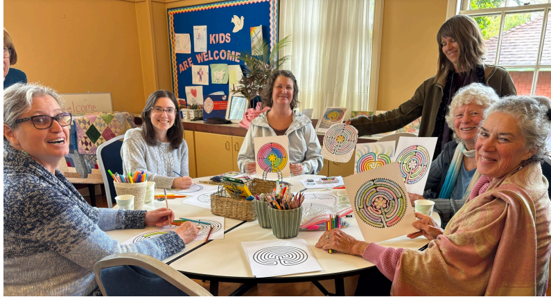
Christ Church participated in the World Labyrinth Day Peace Walk in May 2025