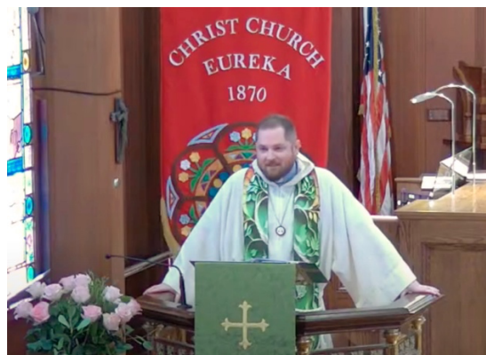
Christ Church began celebrating the Season of Creation for the first time in September