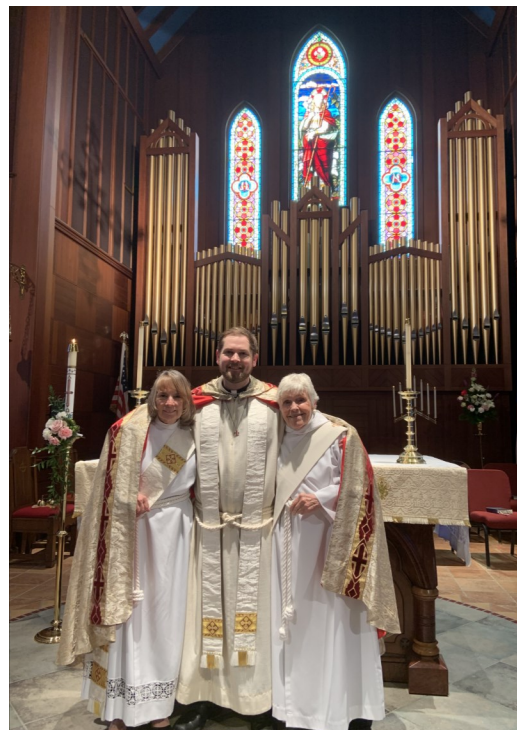
Easter at Christ Church