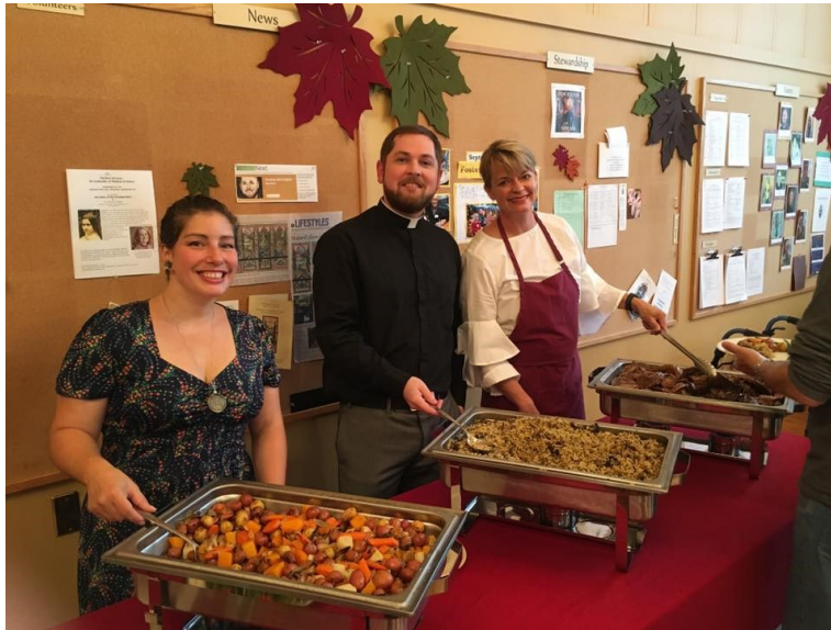
Stewardship Dinner, September 29

I do not visit the redwoods to be awakened, taught, or transformed by them. I visit them to simply bask in their glory, and as a result, I am often awakened, taught and transformed. Likewise, let us worship God not for “what we get out of it” but rather to bask in God’s glory. And what better place to worship God than here at Christ Episcopal Church Eureka, a church made almost completely out of that same awe-inspiring coast redwood. If you listen closely, you will hear the redwood of our church joining us in worship, along with the angels and archangels and all the company of heaven.